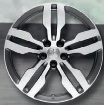
18" Archipel Alloy Wheels