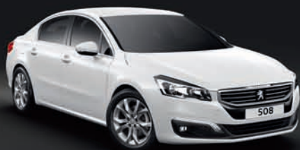
PEARLESCENT PAINT - Pearl White