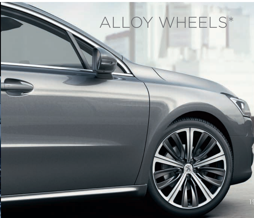
19" Capella Alloy Wheels (Style 12)