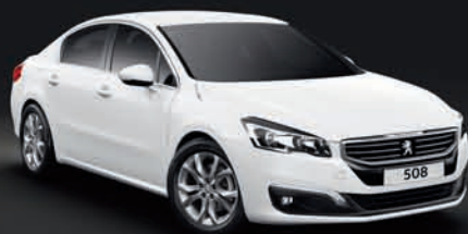
SOLID PAINT - Bianca White