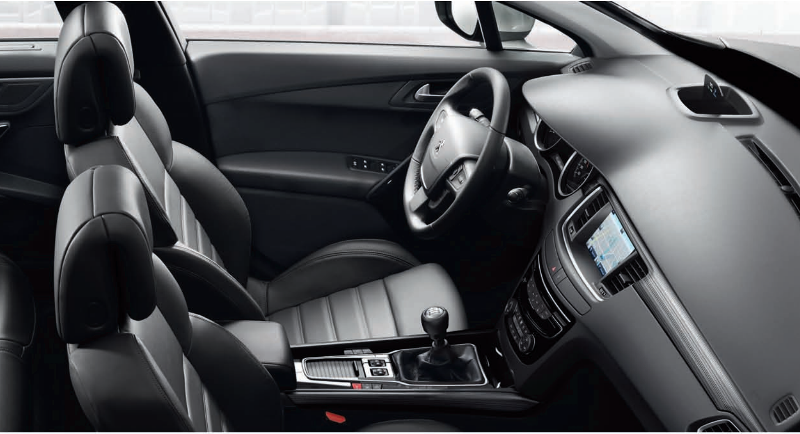
Simple Nappa Full Grain Leather (Black)