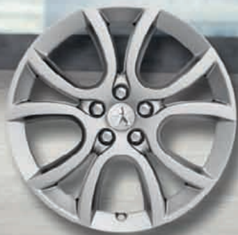
18" Naos Alloy Wheels (Style 7)