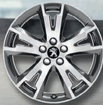
18" Grand Angle Alloy Wheels